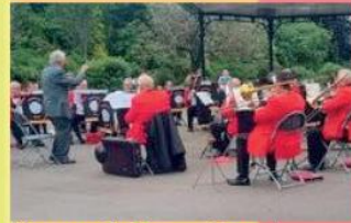
Haworth Brass Band

1pm - 5pm Gala with music, entertainment, stalls & youth activities.