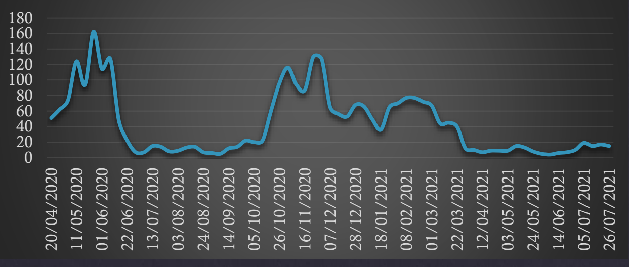
Number of Covid-19 Infections