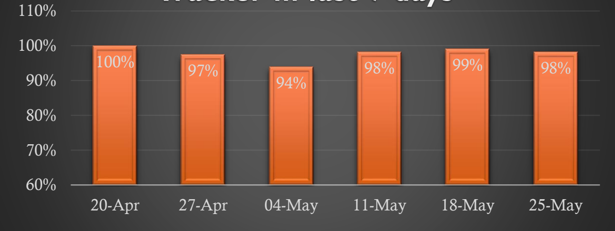
Number of Covid-19 Infections